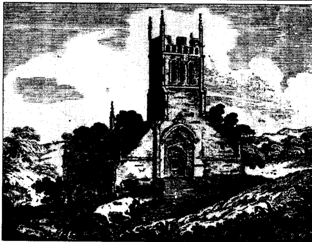
The ancient St Kenelm's Church near Romsley, in an engraving dating from 1800, which is the starting point of the St Kenelm's Way.

If the legend of St. Kenelm is the central idea of the walk, I would suggest that the unifying theme can be identified as the religious life of medieval England. As many as ten churches dating from the Middle Ages can be found en route; in addition, there are two holy wells associated with St. Kenelm and two ruined monasteries, Wincombe and Hailes Abbey. If I also consider the famous monasteries that lie near the route, at Halesowen, Worcester, Evesham, Pershore and Tewkesbury, it can be seen that the area covered by the walk has a rich and ancient religious tradition.