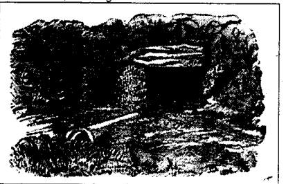
The spring, said to have sprung up at the site of the murder of the young king, as it looked at the turn of the last century.